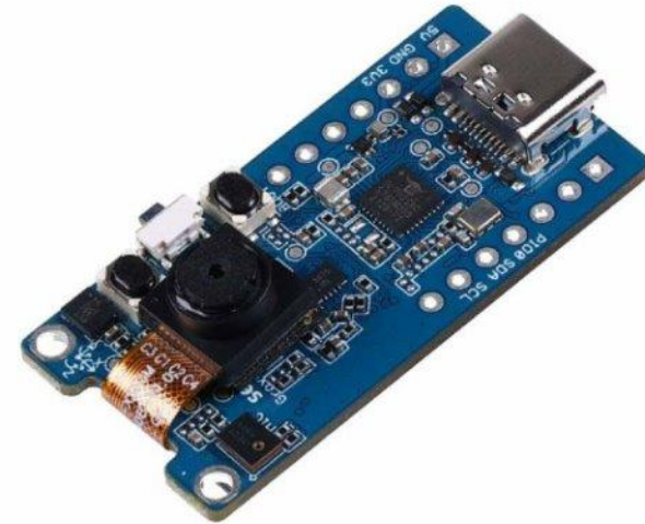
Example: automated detection of insects and gas (MoMu)